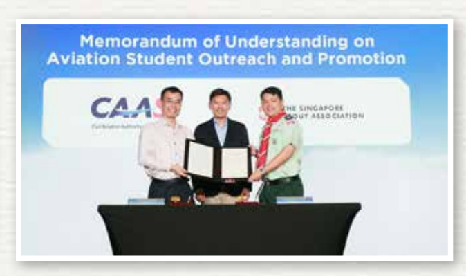
The Civil Authority of Singapore (CAAS)