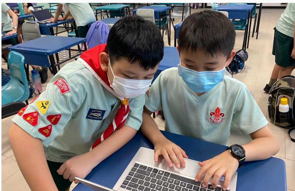
Cub Scouts from Elias Park Cub Scout Group working on a DJC activity.

Email your experiences with the DJC at communications@scout.sg and stand to be featured by SSA in outreach materials.