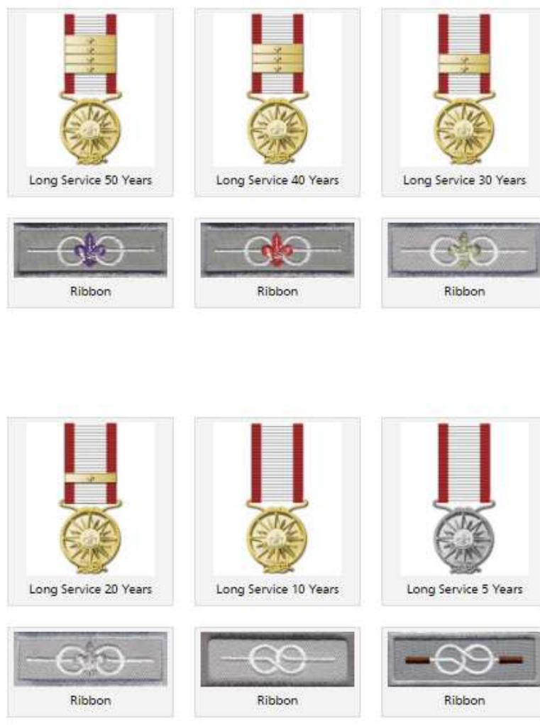
A graphic showing some of the Long Service Awards of the Singapore Scout Association. This series of Long Service Awards were launched in 2010.